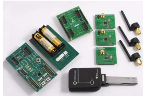
DK-EM2-2520Z Kit Contents

The Stellaris® 2.4 GHz ZigBee Wireless Networking Kit provides the tools engineers need to set up and develop wireless applications right out of the box including: